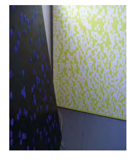
Opposite: Yellow Field II (detail) 2003 Acrylic on Canvas 122cm x 142cm

As Robert Ryman said at the time, the problem for painters is not what to paint, but how to paint. So when I choose to cover a canvas with dots, I'm beginning to solve that problem. I know roughly what form the painting will take, in the same sense that a landscape painter will know they are going to produce a landscape, and I can focus on what really interests me, which is working with paint.