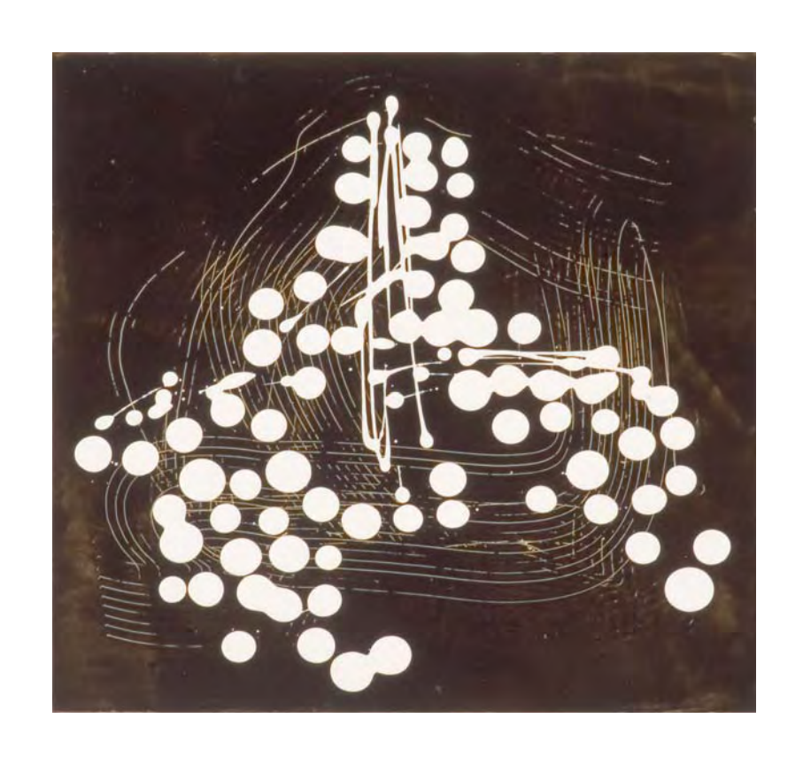
Untitled 2005 Acrylic and Varnish on Laminate 33cm x 34cm